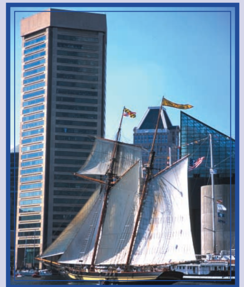
Inner Harbor

Your name may be on several proprietary mailing lists, which we are not allowed to merge with our own list to eliminate duplicate mailings. If you receive multiple copies of the brochure, we encourage you to share your extra brochures with interested colleagues!