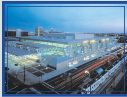
Baltimore Convention Center The Baltimore Convention and Visitors Bureau

(A first night's room deposit or credit card will guarantee your reservation.)