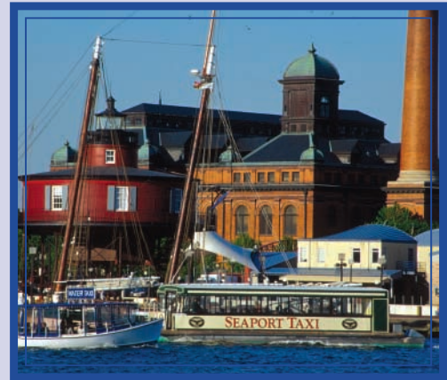
Inner Harbor